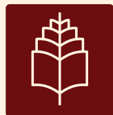
Foundations Learning & Skills Saskatchewan